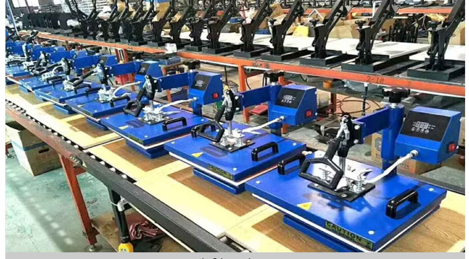
www. the 3dpower house.com