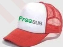
Polyester net cap