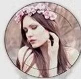
10" coated plate