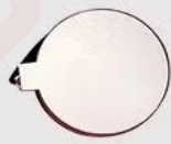
8" Plate heating part