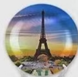
8" coated plate