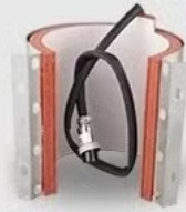
10oz mug mat