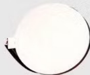
10" Plate heating part