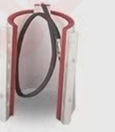
17oz conical mug mat