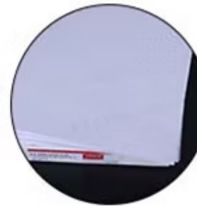
Laser Transfer Paper