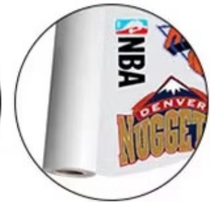
Light/Dark Heat Transfer Paper