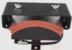
Cap heating part

8.8cm(W)*6.3cm(W)* 15.3cm(H) conical mug