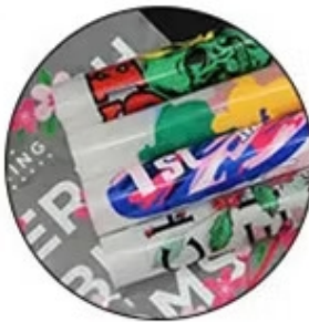
DTF Transfer Film