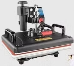
Heat press machine