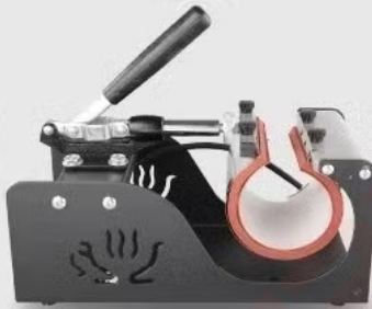
Heat press machine accessories