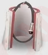
12oz conical mug mat